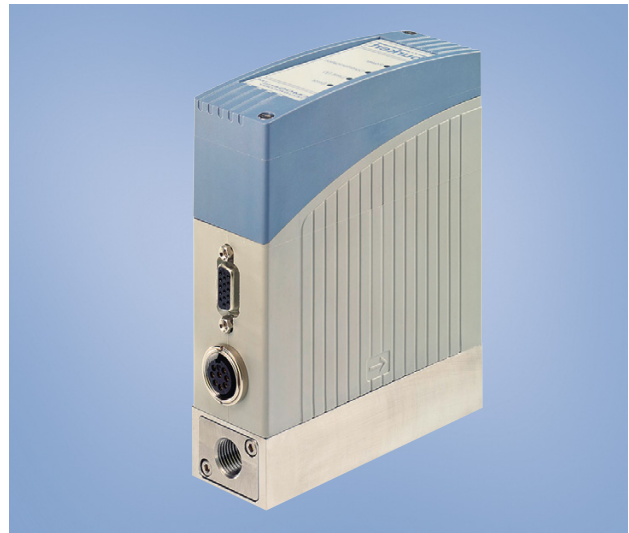
Mass Flow Controller