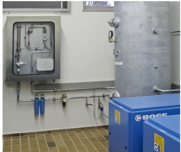
Oxidation air control in Tarmstedt waterworks: before (left) and after (right).