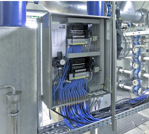
Bürkert pneumatic cabinet for filter control