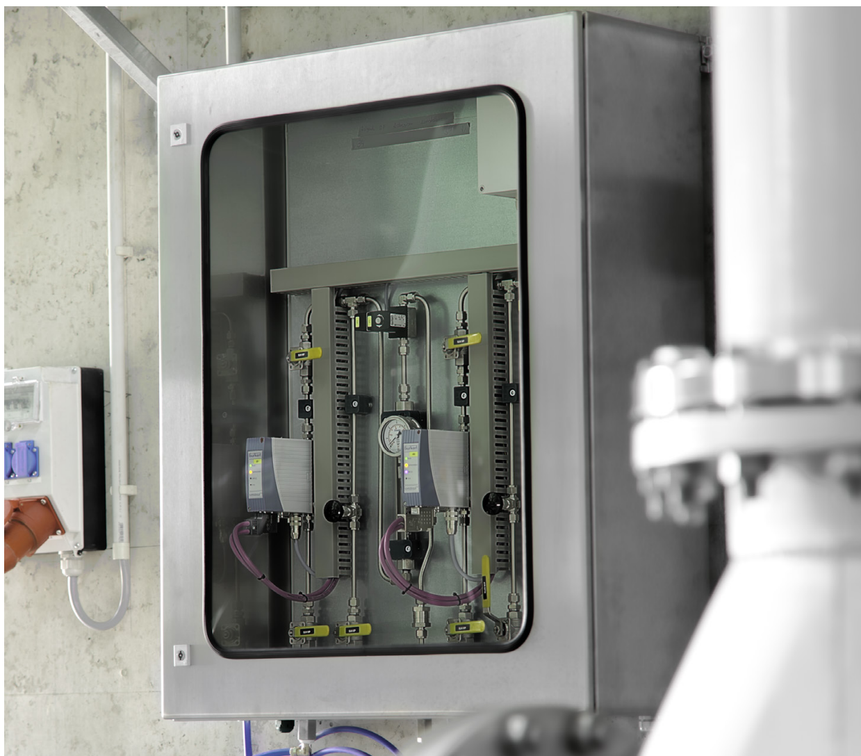
Oxidator box from Bürkert: Two-channel system in Everswinkel Municipal Utilities Waterworks

Correct metering of the oxidation air in the treatment of drinking water depends in many waterworks to this day on one factor: Many years of experience on the part of the waterworks supervisor, who manually supplies the air to the untreated water by means of a simple needle valve. With the Bürkert oxidation air unit this experience is readily available in a controlled and documented process.